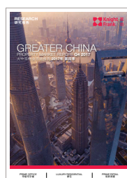
Greater China Quarterly Report Q4 2017

Knight Frank Research Reports are available at KnightFrank.com/Research