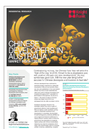
Chinese developers in Australia 2018