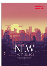
New Frontiers 2018