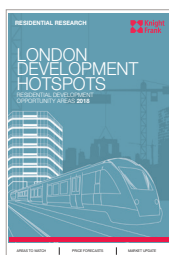
London Development Hotspots 2018